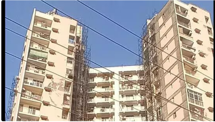
In Noida and Greater Noida, a large number of housing projects don't have completion certificates as the builders have defaulted on paying land cost.

Flat owners in Noida and Greater Noida on Friday welcomed a Supreme Court (SC) order, which held that a builder of a housing complex is legally bound to obtain completion certificate even if the homebuyer was given possession without that mandatory legal document, and said there are about 100 cases wherein possession was offered by the developer without obtaining completion certificate, causing issues for buyers.