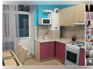
Real Estate Classifieds, India Property, Houses For Sale Or Rent Ad: Yonfi

logo https://timesofindia.indiatimes.com/