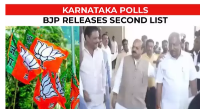
KARNATAKA POLLS BNP RELEASES SECOND LIST

NEW DELHI: In an order which could bring relief to homebuyers (https://timesofindia.indiatimes.com/topic/homebuyers) whose real estate company (https://www.magicbricks.com) is facing insolvency proceedings, the Supreme Court of India (https://timesofindia.indiatimes.com/topic/supreme-court-of-india) on Tuesday ruled that Noida authority (https://timesofindia.indiatimes.com/topic/noida-authority) would be treated as operational creditor and not as a financial creditor (https://timesofindia.indiatimes.com/topic/financial-creditor) like homebuyers (https://timesofindia.indiatimes.com/topic/homebuyers) in the IBC proceedings (https://timesofindia.indiatimes.com/topic/lbc-proceedings). Unlike an operational creditor, a financial creditor can be a