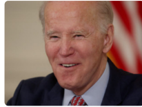
President Biden says he will run again in... Times of India