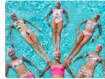
Here's how you can master anything you... TIMES OF INDIA