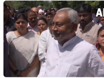
Bihar CM Nitish Kumar calls Asaduddin Owai... Times of India