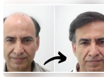
दुनिया हैरान ! इस गंजापन दूर करने वाला तेल देखकर ! Ad: Metrex Hair Oil