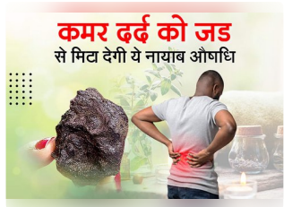
दवाई नहीं हकीम जी के नुस्खों ने दिया कमर दर्द की तकलीफ में आराम Ad: Atiya Herbs