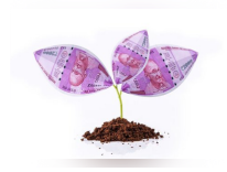
Grow Your Wealth! These Are The Next... Ad: Multibagger Stocks