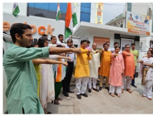
नमो सेवा केंद्र, नोएडा C-62, Sec-65, नोएडा

नमो सेवा केंद्र, खुर्जा गांधी रोड, बंसल मार्केट, खुर्जा