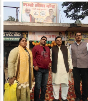
नमो सेवा केंद्र, दादरी

लाला रोशन लाल मित्तल जी की धर्मशाला, दनकौर तिराहा, सिकंदराबाद