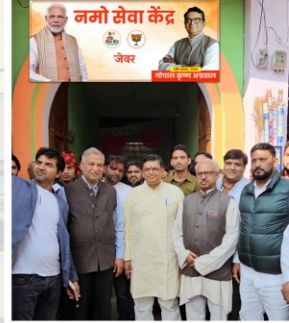
नमो सेवा केंद्र, जेवर

हमारी सरकार ने पिछले लगभग दस वर्ष के अपने कार्यकाल में जन कल्याणकारी योजनाओं के द्वारा उन्नतीस लाख करोड़ रुपये से भी अधिक की राशि का लाभ बिना किसी भ्रष्टाचार या रिसाव के लोगों तक पहुंचाया है। यह मेरे लिए स्वाभिमान का विषय है।